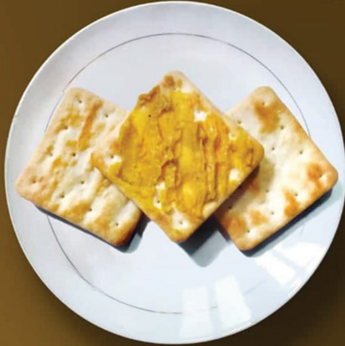
Pumpkin with Peanuts Wild Rabbits Products