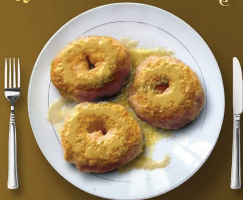
Pumpkin with Garlic Wild Rabbits Products