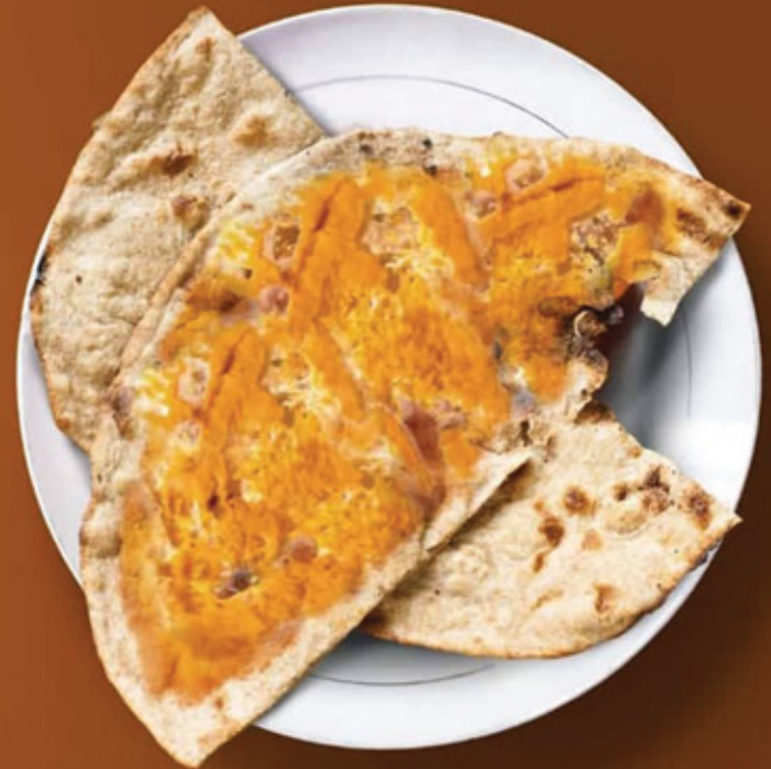
Carrot with Spice Wild Rabbits Products