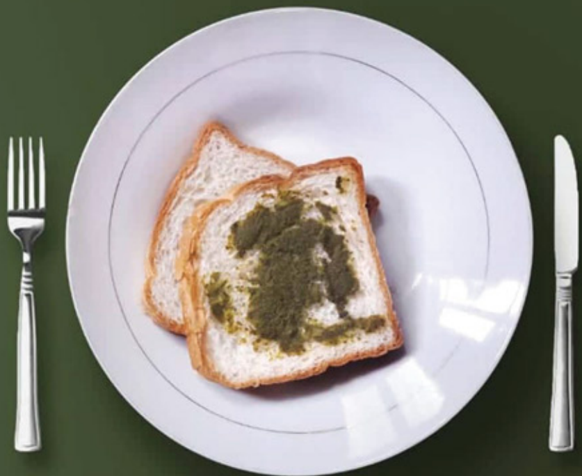
Bitter Gourd with Drumstick Leaves Wild Rabbits Products